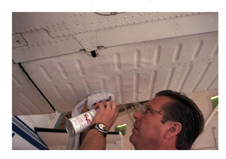
Using <u>Powerfoam</u> to clean bugs off bottom of flap on Cessna 206.