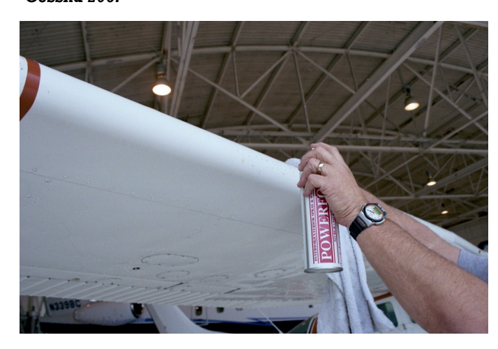
Use <u>Powerfoam</u> or <u>Quick-Turn</u> to clean bugs from leading edges of Cessna 206.