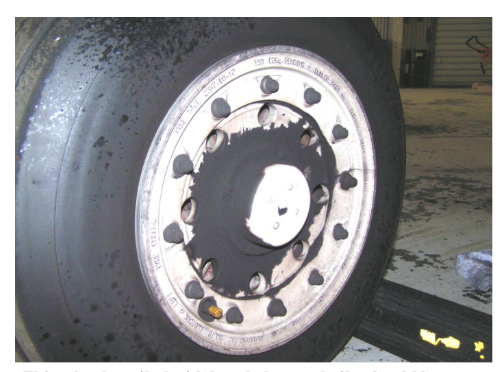
This wheel - soiled with break dust and oil - should be cleaned with <u>Bio Jet.</u>