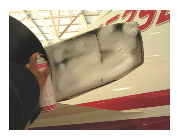
<u>Powerfoam</u> removing carbon from exhaust deflector at the rear of Hawker 1000.