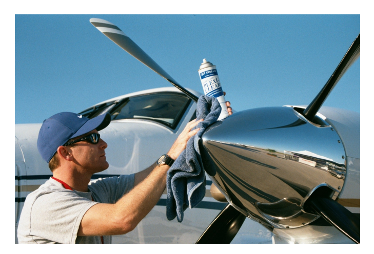
Use <u>Plexi-Clear</u> or <u>Quick Turn</u> to clean polished aluminum spinner on King Air 200.