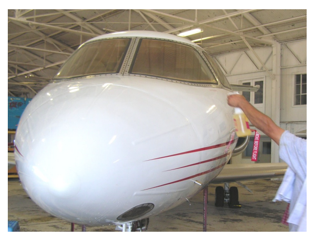
Using <u>Quick Turn</u> to clean bugs and dust from the fuselage of a Hawker 1000.