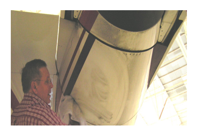
<u>Powerfoam</u> is our choice to clean the bottom of dirty engine nacelle on a Hawker 1000.