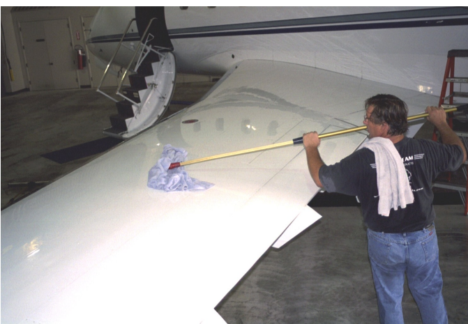
To remove dust from the top surfaces of aircraft when dry washing, use a towel wrapped around a squeegee. Spray the top of wings with <u>Quick Turn</u>, it will help the towel pick up dust from surfaces of aircraft.

Dry Wash Aircraft: Dry washing is really an outstanding way to maintain an aircrafts exterior. There are several reasons for it's growth in popularity. One is that large parts of the aircraft are being waxed during this process. Another reason is the EPA's regulating of what goes down the drains at airports and fining those who don't meet their requirements. This is not an issue when dry washing an aircraft. The solution to dry washing is using products which effectively clean carbon, bugs, oil, and hydraulics from the surface of the paint. The most important characteristic that a dry-wash wax must possess is the ability to be easily removed from the surface once it has dried. The advantage of Powerfoam is that it cleans faster than wax. Powerfoam does a great job at removing carbon, oil and bugs from aircraft surfaces leaving a clean streak free finish to the paint. Powerfoam is also a great product to clean the landing gears, flaps, belly, wings, engine nacelles, and engine cowlings during the dry-wash process. Use Plexi-<u>Clear</u> to clean windows, polished aluminum, bugs from nose of aircraft, and leading edges. Use Quick Turn with towels for dusting wings and fuselage of aircraft Now you are prepared with the correct products and procedures to successfully dry washing an aircraft.