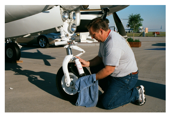
Using <u>Powerfoam</u> to clean bugs and grease from nose gear of King Air 200.

When cleaning with Jet Stream dry wash chemicals, you will have to decide which product is best for the job. This decision will be determined by several factors. What condition is the paint? New? Old? Oxidized? How bugged up is the aircraft? How dirty is the belly? Is it a turbo prop covered with exhaust stains? etc... Once you become experienced with our dry wash chemicals, the choice of product selection will be very simple. The Jet Stream dry wash system will effectively clean whatever challenge an aircraft throws your way.