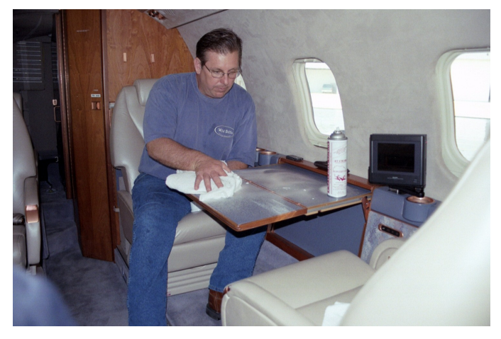
Using <u>Powerfoam</u> to clean food stains from pull out table top in Lear 60.