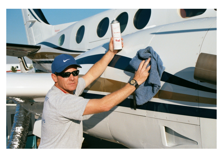
Using <u>Powerfoam</u> to clean carbon and oil from a King Air 90 engine cowl.

Removing Carbon, Bugs & Oil: Powerfoam or Flyers Speed Wax are excellent ways to clean all aircraft surfaces shown in adjoining photos. If the aircrafts paint is in excellent shape use Plexi-Clear or Quick-Turn. BIO-JET is designed to clean bellies, gear wells, or any other surface covered with heavy accumulations of oil, hydraulics, and carbon as seen in photo of Hawker 1000 landing gear doors on page 26.