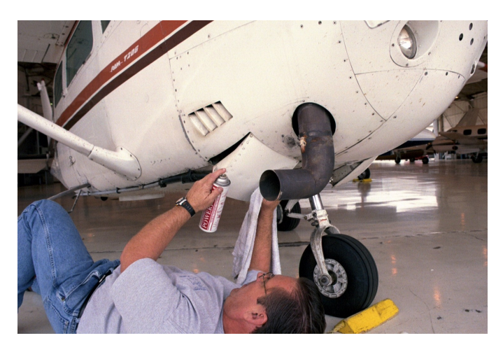
Use Powerfoam or BIO-JET to clean belly on Cessna 206