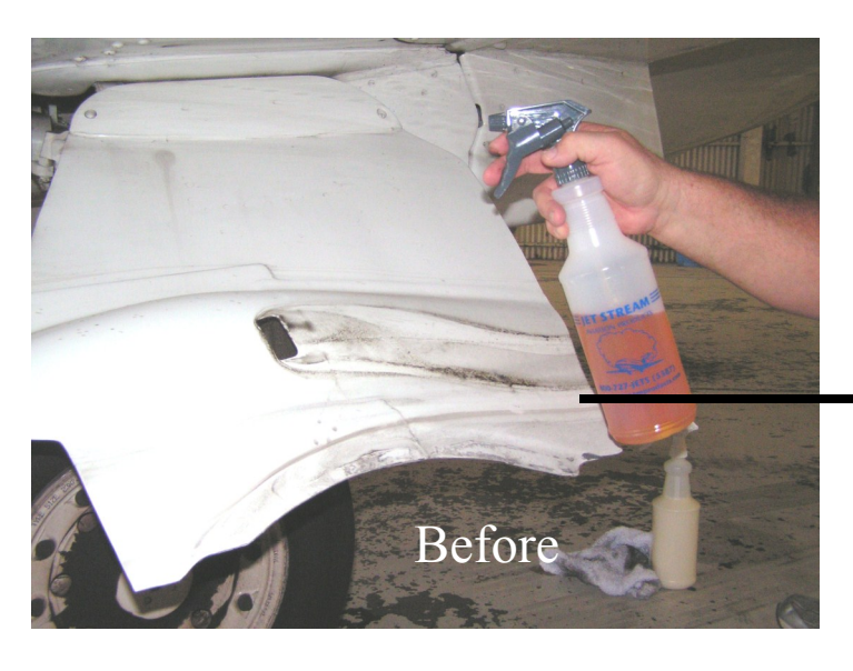
Using <u>Bio Jet</u> to remove heavy accumulations of hydraulics from the gear door of a Hawker 1000.