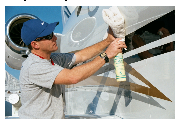
Use <u>Flyers Speed Wax</u> or <u>Quick-Turn</u> to dry wash the fuselage on Raytheon Premier jet aircraft.