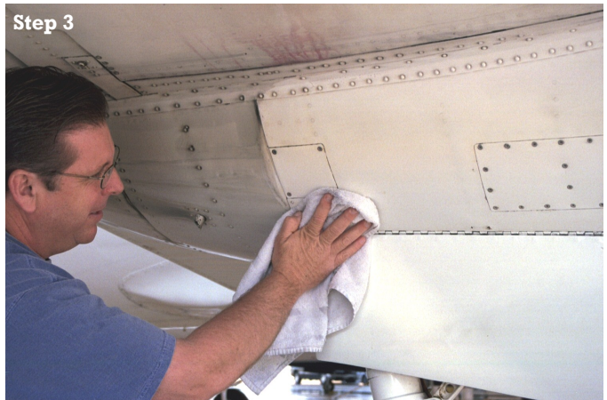
Three simple steps using <u>Powerfoam</u> when cleaning carbon and oil from gear door and bottom of cowling on King Air 90.