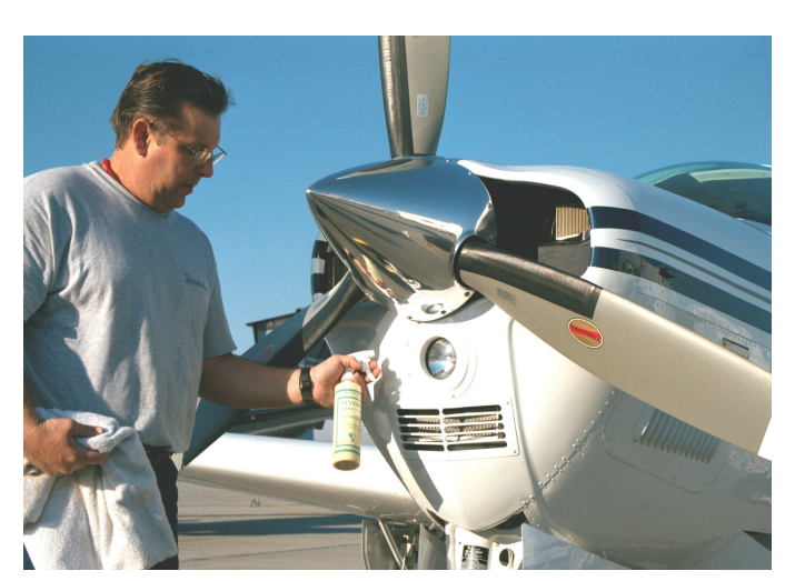
Using Flyers Speed Wax to remove bugs from nose of A-36

Dry Washing Aircraft: If you own, operate, or maintain an aircraft, dry washing will most likely become part of the regular cleaning method used to maintain the cosmetic appearance. Due to EPA regulations and monitoring, more and more aircraft operators are being forced to switch to dry washing. In the perfect situation, the aircraft operator has both cleaning options available. Dry washing is an excellent method of maintaining the aircrafts exterior. The advantage of dry washing an aircraft is the ability to wax the aircraft at the same time you are cleaning it. Especially, the more abused sections like behind the exhaust stacks on a King Air or the APU and reverser areas on corporate jets. Waxing these areas remove all carbon build-up and carbon stains from surface of paint. This also leaves the most abused areas on an aircraft protected when the aircraft goes back in service. In this part of the manual, we will use photos of different products performing dry wash procedures.