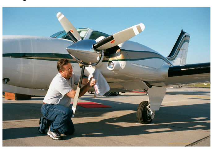
Using <u>Powerfoam</u> to clean bugs and oil from Barron B-58 engine cowling.